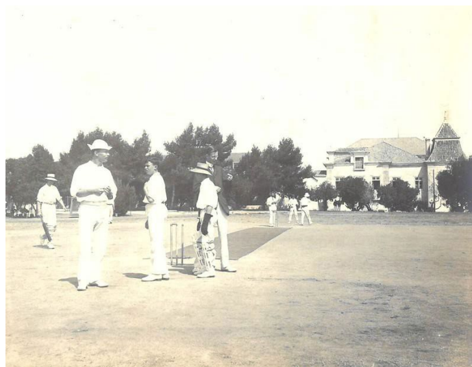
Figure 3: Cricket match at Carcavelos Telegraph Station, date unknown.