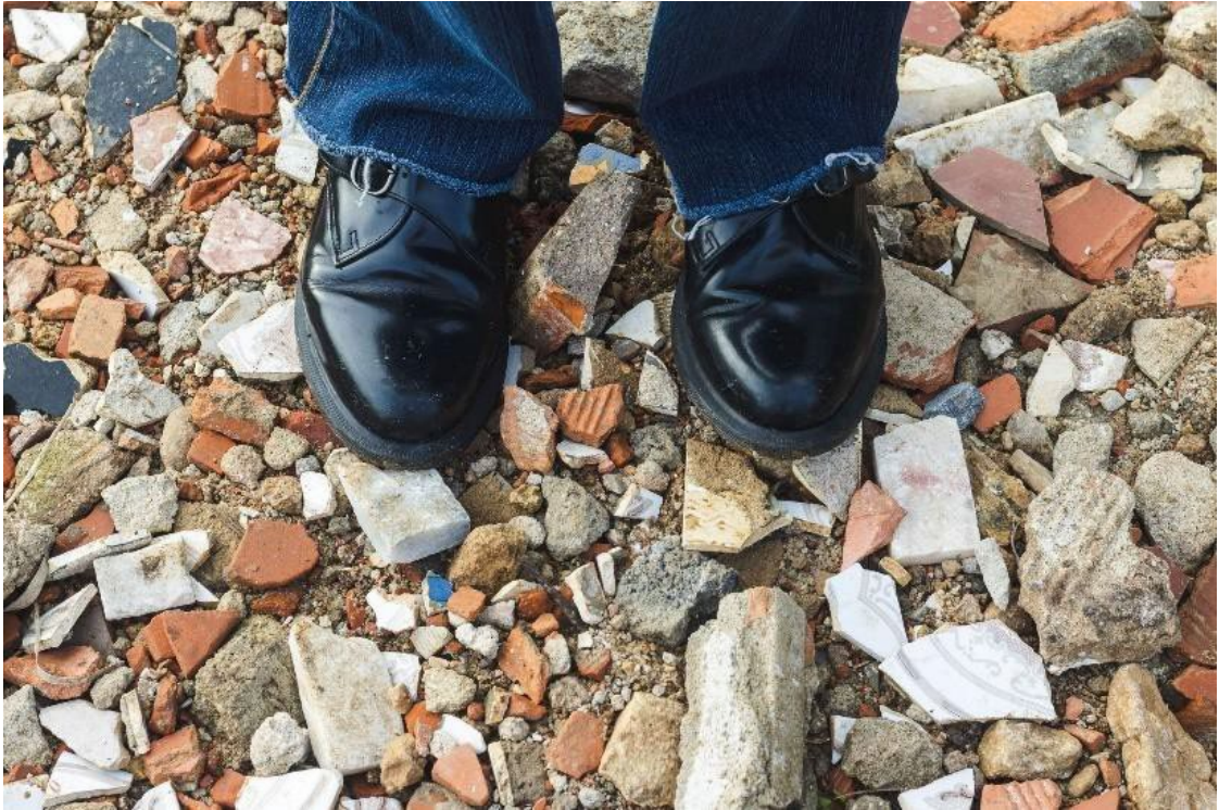
Figure 10: Rubble and fly-tipping pervades the woodland site at Quinta dos Ingleses. Photo by M.C. Twomlow, Dec. 2022.