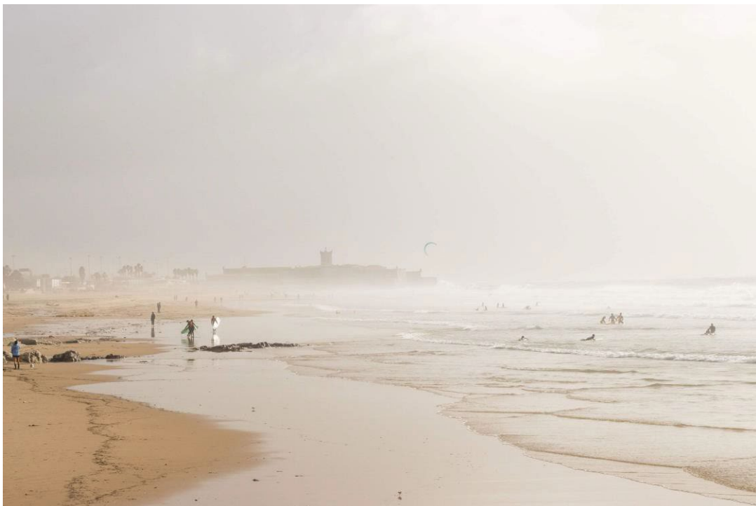
Figure 8: Praia de Carcavelos surf beach. Photo by M.C. Twomlow, Dec. 2022.

The Quinta dos Ingleses is situated close to the famous Estoril coastline in the district of Cascais, with just a road width between its borders and the Praia de Carcavelos. Praia de Carcavelos is reputedly Portugal’s “first-surfed and often best beachbreak” (Surflines, 2023). The largest and most popular beach on the Lisbon coast, it has near legendary status and a thriving surf culture, even in winter. As a popular beach-focussed tourist destination, Carcavelos has parallels to Porthcurno beyond its cable history. As a resident and business manager in Porthcurno, I recognise the importance of “surfonomics” to our local economy; meaning the financial contribution of surf culture to the local economy (Save the Waves, 2015-2023). I deduce from this that Carcavelos beach must have a similar financial role to play for its residents, business owners and the Municipality.