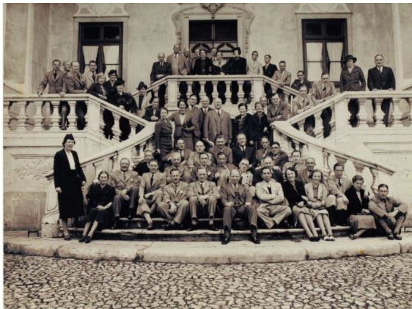
Figure 5: Group photograph of staff on the front steps of the Palacio, Carcavelos Telegraph Station, circa 1930. PHO//5804.

However, it was not just British staff working at the Carcavelos station. By 1883 local people began to find employment there, with the Eastern Telegraph Company advertising vacancies in the local press and recruiting Portuguese probationers. However, it was during the First World War that Portuguese staff numbers increased significantly and rose steadily thereafter. By 1924 the staff numbers had reached a maximum of 155, with nearly a third Portuguese to two thirds English. Portugal’s neutrality during World War Two meant that the station at Carcavelos was relatively safe from attack, unlike the station in Singapore. It did not receive the level of attention that Porthcurno had, where the station in its entirety was relocated into specially dug underground bunkers. However, Carcavelos was nonetheless strategically important to keeping communications open and secure.