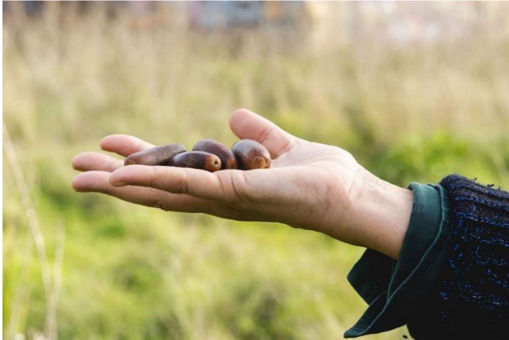
Figure 12: Guerrilla planting at the Quinta dos Ingleses is a regular activity of the SOS group. Dec. 2022.

We stopped for a moment to carry out some “guerrilla planting” as the SOS members explained. They were taking every opportunity to protect and renew the precious woodland including planting acorns around the site (see Fig 12).