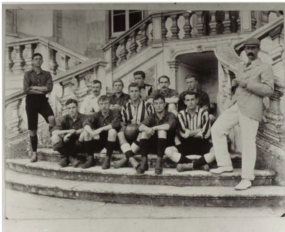
Figure 4: Photograph of football team members in front of Carcavelos quarters, circa 1901.

After cricket, other sports followed which were previously little known in Portugal, including tennis, football and cycling. The football ground at the Quinta Nova was the first in Portugal and the game found an appeal with the Portuguese who first played against the staff of the cable station in mixed Anglo-Portuguese teams, before forming clubs of their own. The tennis courts at the station were also popular, with the King Carlos of Portugal himself coming there to play. Along with a new interest in team sports, adopted from the English telegraph workers, came the beginnings of the idolisation of the sportsman as hero. According to Lisboa et al, “This phenomenon gave origin to a previously unheard of cultural core in Portugal. Thus, a new identity started to be built in Carcavelos and its surrounding areas.” (Silva, Lisboa, & Martins Naia, 2013, p. 327). Alongside sport., amateur dramatics, English Fairs and dances were also a regular form of entertainment. In the 1920s, a large recreation hall was built with a stage and bar.