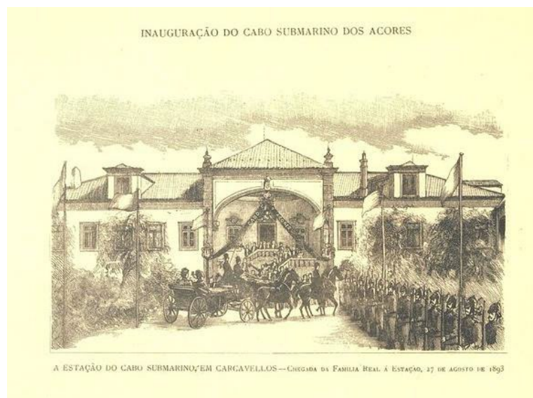
Figure 2: Inauguration of the Submarine Cable in the Azores.

When the station first opened, mirror galvanometers were used to receive messages. This was a relatively a slow method, but in June 1871, the Thomson Siphon Recorder was brought in to Carcavelos to improve speed and accuracy. Sir William Thomson himself oversaw the installation. Gradually, more cables were introduced including a duplication of the “Por-Car-One” Carcavelos to Porthcurno cable with the “Por-Car-Two” in 1872 (Barty-King, 1979, p. 120). This was followed by Porthcurno to Vigo via Carcavelos in 1873, Carcavelos to Pernambuco (Brazil) via Madeira and Cape Verde Islands in 1874, Carcavelos to Azores in 1893 ( Fundação Portuguesa das Comunicações, 2015). The arrival of the Brazil cable was a particularly important development and from this point and necessitated a substantial increase in staff numbers at the station.