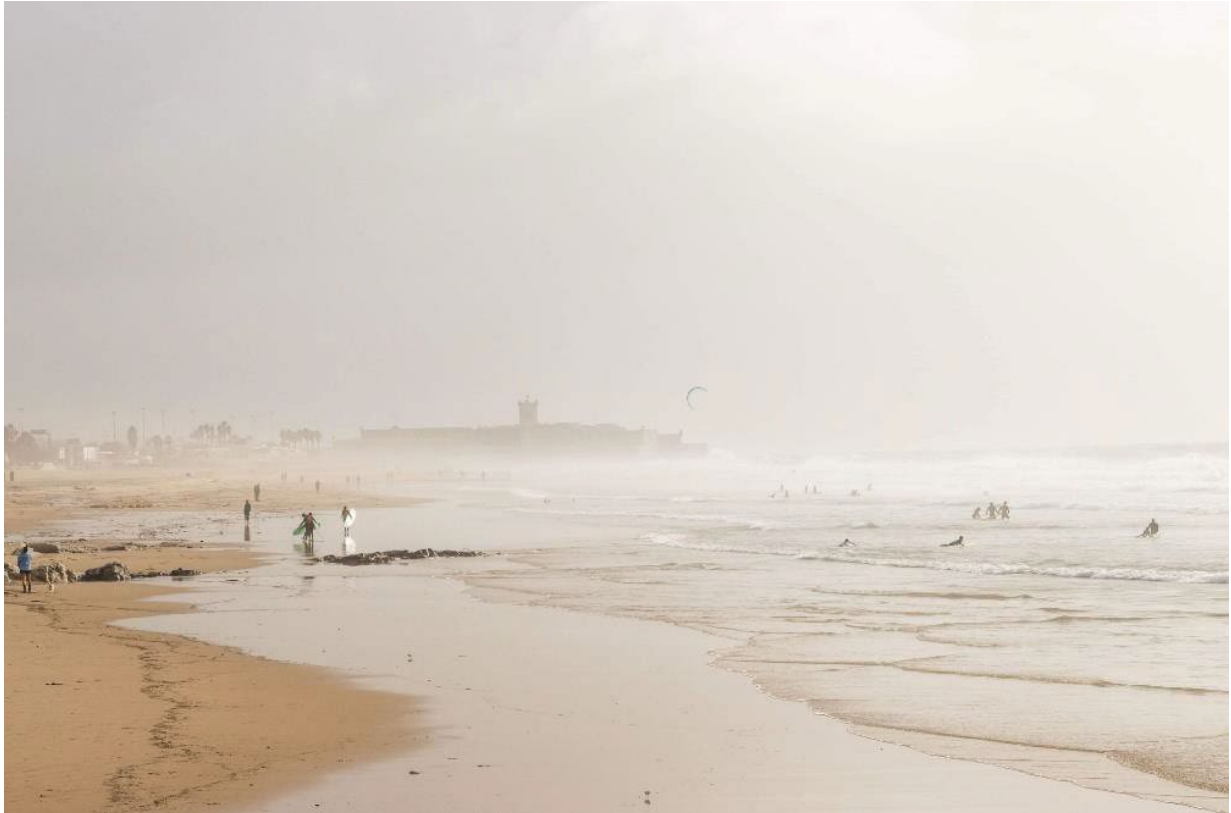
Figure 14: Praia de Carcavelos surf beach. Photo by M.C. Twomlow, Dec. 2022.