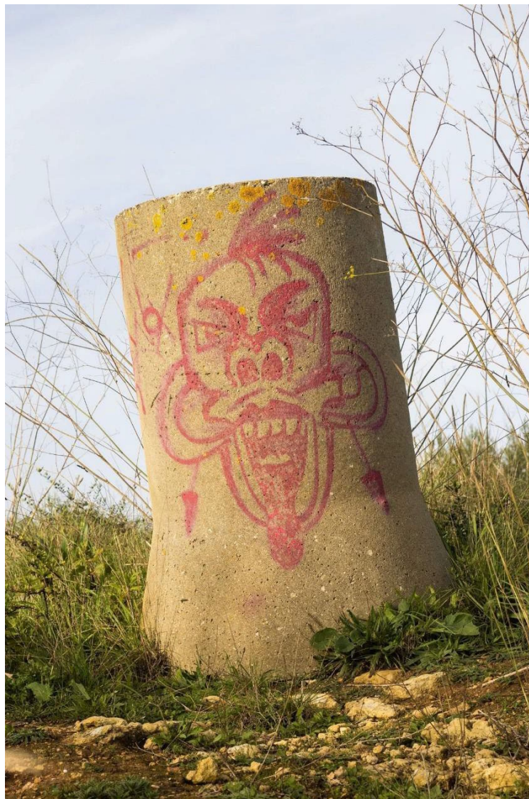
Figure 15: Graffitied concrete sewage pipe at the Quinta dos Ingleses, Carcavelos. Debris from an abandoned development attempt and now part of the landscape. Photo by M.C. Twomlow, Dec. 2022.

From my observations and research, it appears to me that the social complexity created by the entrenched stakeholders’ positions in relation to the Quinta dos Ingleses is compounded by the apparent reluctance of the Municipality to adopt a position of moral responsibility and help find a solution. In turn this is exacerbated by the reluctance of other influential groups, like ANACOM, to take a stance. This combination of factors leads me to conclude that the trouble at Quinta dos Ingleses is what could be termed a “wicked problem”, by which I mean it is not intrinsically evil but “diabolic” in terms of its resistance to normal methods of resolution (Rittel & Webber, 1973).