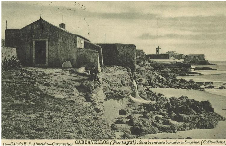
Figure 1: Postcard showing the cable hut where submarine cables came ashore near Carcavelos beach, c. 1920.

When the station first opened, mirror galvanometers were used to receive messages. This was a relatively a slow method, but in June 1871, the Thomson Siphon Recorder was brought in to Carcavelos to improve speed and accuracy. Sir William Thomson himself oversaw the installation. Gradually, more cables were introduced including a duplication of the “Por-Car-One” Carcavelos to Porthcurno cable with the “Por-Car-Two” in 1872 (Barty-King, 1979, p. 120). This was followed by Porthcurno to Vigo via Carcavelos in 1873, Carcavelos to Pernambuco (Brazil) via Madeira and Cape Verde Islands in 1874, Carcavelos to Azores in 1893 ( Fundação Portuguesa das Comunicações, 2015). The arrival of the Brazil cable was a particularly important development and from this point and necessitated a substantial increase in staff numbers at the station.