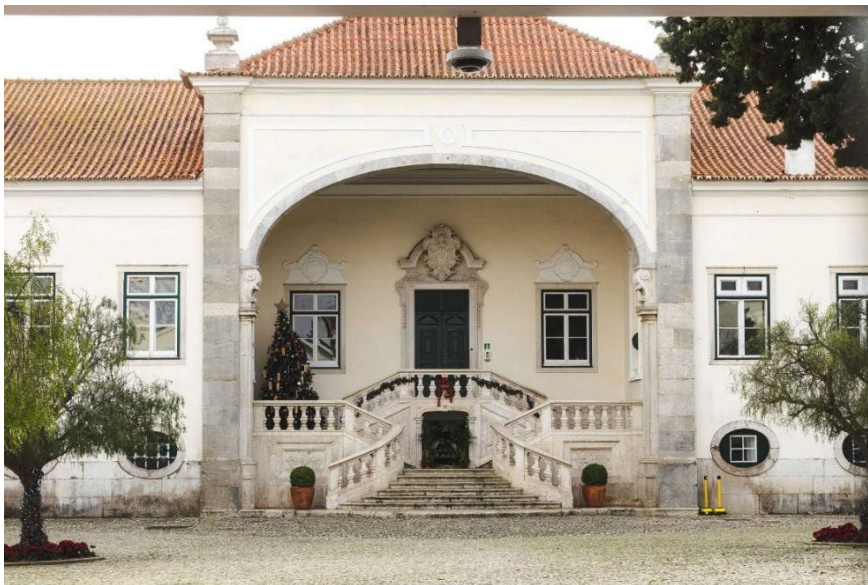
Figure 7: Entrance to St Julian's School, decorated for Christmas, 2022. Photo by M.C. Twomlow, Dec. 2022.

Established in 1932, St Julian's is a fee-paying day school which sits at the centre of the Quinta dos Ingleses with access to the surrounding town and link roads via two avenues which cross land owned by Alves Ribeiro Construções (see Fig 6). While considered 'British' in terms of its education system and history, the school has an international student body, with intake from 45 different countries. The curriculum covers ages 3 to 18 years, with around 1500 pupils on the register at any given time. The school occupies the historic Palacio (see Fig 7), which was part of the original farm complex of the Quinta Nova, and which became the buildings and accommodation for the original Carcavelos Cable Station owned by the Eastern Telegraph Company. The school is now owned and governed by the St Julian's School Association; a voluntary, non-profit making organisation with a membership of approximately nine elected governors (St Julian's School, 2023). The Association has responsibility,