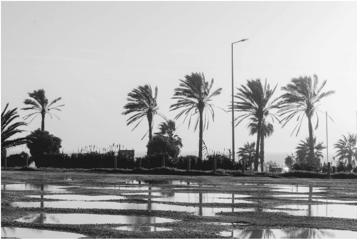
Figure 13: Avenida Marginal and Carcavelos beach beyond, as seen from the Quinta dos Ingleses. Flooding was evident on the day of our visit. Photo by M.C. Twomlow, Dec. 2022.