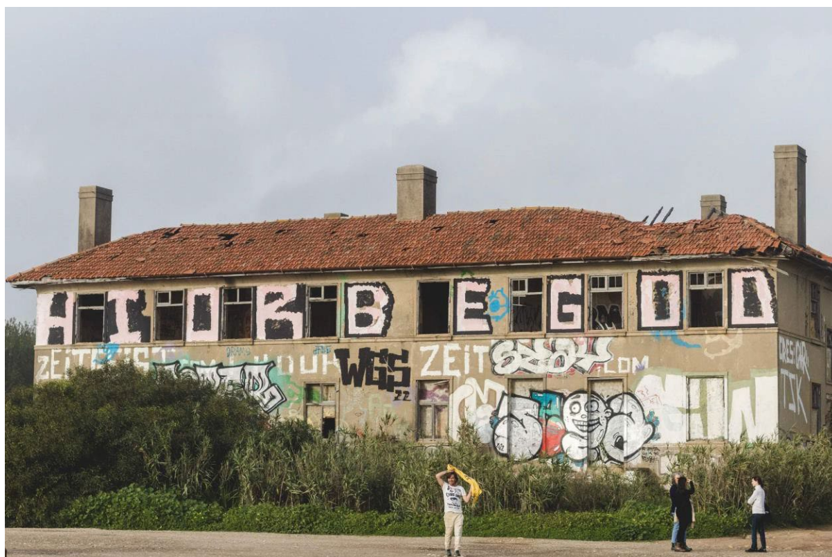
Cover Photo: Historic building of the former Carcavelos Telegraph Station, now in a state of dereliction. Photo by M.C. Twomlow, Dec. 2022.

Reconnecting Communities Through Heritage Activism