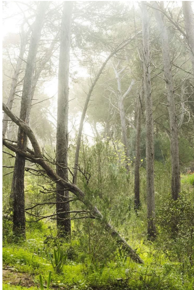
Figure 9: Woodland at the Quinta dos Ingleses, Carcavelos. Photo by M.C. Twomlow, Dec. 2022.

economic model that fosters unrealistic notions of unlimited global growth without adverse impact on the biosphere. To do this, he suggests, demands a high level of self-responsibility, but it also it requires that we “develop an affection for Nature and its processes”.