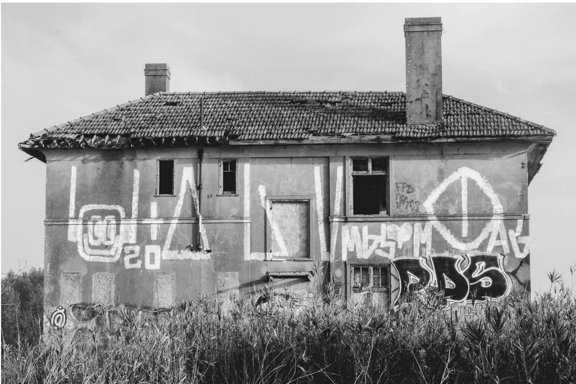
Figure 11: Derelict building that once formed part of the historic Carcavelos Telegraph Station. Photo by M.C. Twomlow, Dec. 2022.