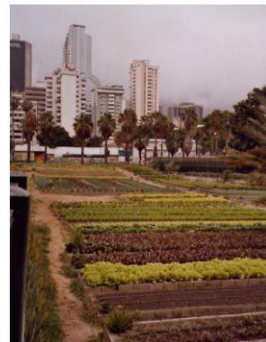
Figure 2: Venezuelan response to peak oil: localised agriculture

Combined, these facts make not just a complicated puzzle that can be solved or fixed but a complex problem of a scale with no historical precedence and without any one clear “answer”. Facts 3 and 4 were drawn from Dr Chris Martenson’s The Crash Course 6 , a sustainability leadership programme that concludes “Within our lifetime and that of our children, these disparate facts will coalesce into the greatest economic and physical challenge ever faced by humanity. We need to begin telling ourselves new stories about who we are and what’s really important to us.”